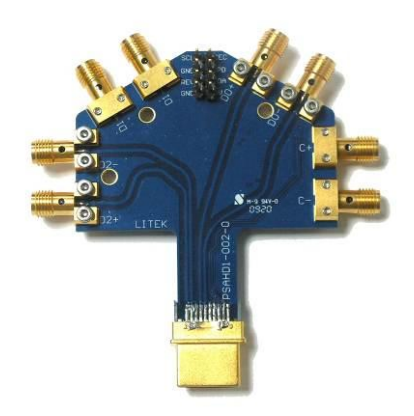
Figure 2: HDMI-AP03AR(HAD-13) HDMI Probe Test Fixture