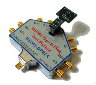
Fig 2: HDMI-DP01A with EDID

fixture used to measure HDMI connector or HDMI source with HDMI Type D receptacle connector and connected with HDMI D type cable assembly. There are 4 pairs with SMA connectors in the Scope or Signal generator sides. The impedance in the test fixture is well designed between 95~105 ohms. The intra pair skew for all 4 pairs are designed less than 3ps.