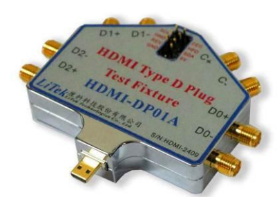
Fig 1: HDMI Active Type D Plug test fixture (HDMI-DP01A)

LiTek's HDMI-DP01A is a HDMI Type D Plug test