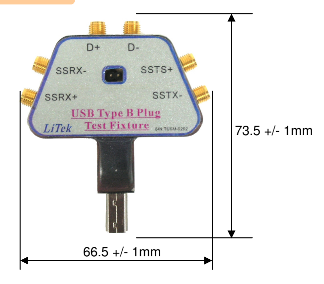
Fig4: USB3-BP01A dimensions