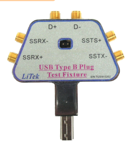
Fig1: USB3.0 Type B Plug Test Fixture (USB3-BP01A)

LiTek's USB3.0 Type B Plug Test fixture (USB3-BP01A) can be used to measure the Device with USB3.0 Protocol Signal Generator or Real-Time Scope. It can be used to measure USB3.0 Type B receptacle connectors with suitable test settings.