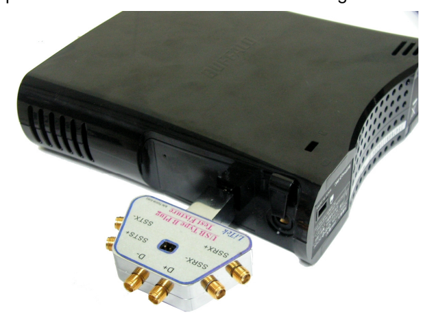
Fig2: USB3-BP01A plugged into USB3.0 Device

LiTek's USB3.0 Type B Plug Test fixture (USB3-BP01A) can be used to measure the Device with USB3.0 Protocol Signal Generator or Real-Time Scope. It can be used to measure USB3.0 Type B receptacle connectors with suitable test settings.