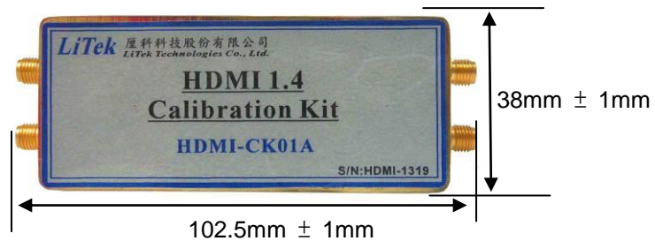
Figure2: Dimension of HDMI-CK01A

LiTek's HDMI 2X Trace Calibration fixture (HDMI-CK01A) can be used to calibrate the response of the HDMI Type A test fixture. We can get more accuracy by using the Calibration Fixture before testing.