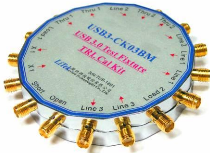
Fig1: USB3.0 2X Trace TRL Calibration Fixture(USB3-CK03BM)

LiTek's USB3.0 2X Trace TRL Calibration fixture (USB3-CK03BM) can be used to calibrate the response of the USB3.0 Type A or USB3.0 Type B or USB3.0 Type Micro A/B test fixture .We can get more accuracy by using the Calibration Fixture before testing.