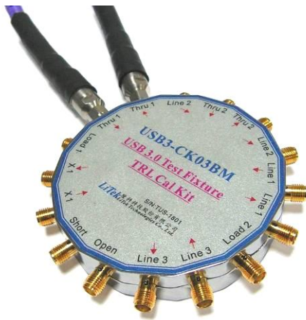
Fig2: USB3-CK03BM connected with SMA Coaxial cable from Equipment for calibration before testing.

LiTek's USB3.0 2X Trace TRL Calibration fixture (USB3-CK03BM) can be used to calibrate the response of the USB3.0 Type A or USB3.0 Type B or USB3.0 Type Micro A/B test fixture .We can get more accuracy by using the Calibration Fixture before testing.