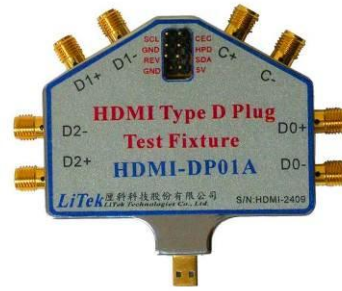
Fig3: HDMI-DP01A, HDMI Active Plug Test Fixture