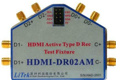
Fig1: HDMI-DR02AM, HDMI Active Rec Test Fixture

For long or thin HDMI cable application, most of people will design an active solution inside the cable. In general, most assembly will test their passive HDMI cable by using the Signal generator and TDR as scope to check the Eye diagram result. But this solution can be used only for passive cable. Now, LiTek announced a solution for HDMI active cable eye diagram testing by using the same instruments. LiTek's HDMI-DR02AM HDMI Active Rec Test fixture set can be used to test HDMI active plug cable. LiTek's HDMI-DP01A HDMI Active Plug Test Fixture set can be used to test HDMI active receptacle cable.