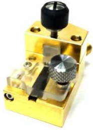
Fig 1: LT-100R-40G-30C Raw Cable Test Fixture

LT-100R-40G-30C 40GHz raw cable test fixture is specifically designed to test high speed twin-axial cable signal integrated quality. It's a low cost solution with flexibility and versatility. Most of the transmission interfaces recently are designed with differential impedance with range from 85 to 100 ohms, just like QSFP, SAS, HDMI, DisplayPort, USB Type C ...etc. The bandwidths of these interfaces are even up to 40GHz. In that, a good and suitable fixture that can cover UTP, STP, Twin-axial and coaxial cables, becomes very essential.