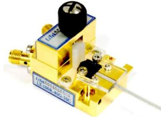
Fig 3: LT-100R-40G-30C with DUT

There is a twin-groove for the conductors of twin-axial cable. User just needs put the conductors of pair and contact with the groove. Screw the knobs down and press the plate to fix the twin-axial for the measurements.